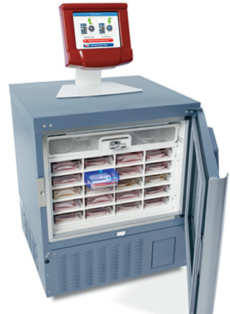
Works with standard refrigerators or HaemoBank devices

Works with standard refrigerators or HaemoBank® devices